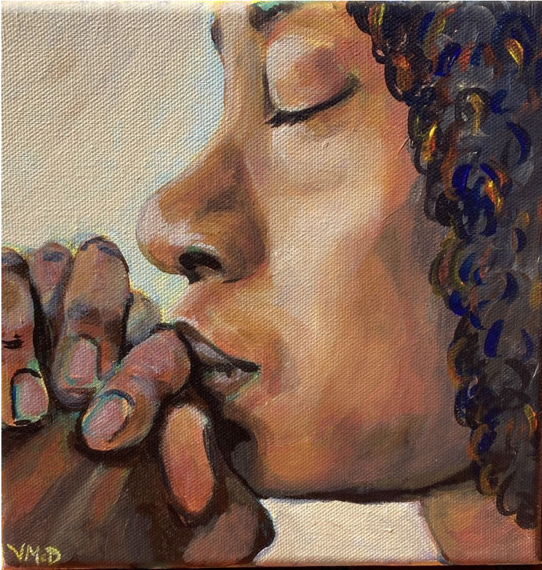
Prayer Warrior II (2025) by Veronica McDonald, acrylic on canvas.